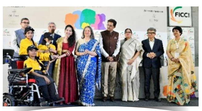
26. FICCI FLO Indore Engages in Exclusive Interaction with Principal Secretary of Industrial Policy and Investment Promotion, Madhya Pradesh | April 6, 2023 | Indore