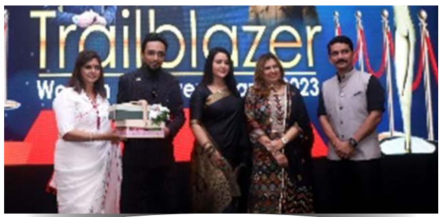
24. Be You - The Finale! YFLO Young Achievers Awards 2023 | March 25, 2023 | Kolkata