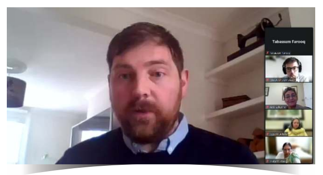
18. Global Millet (Shree Anna) Conference | 19th March 2023 | New Delhi